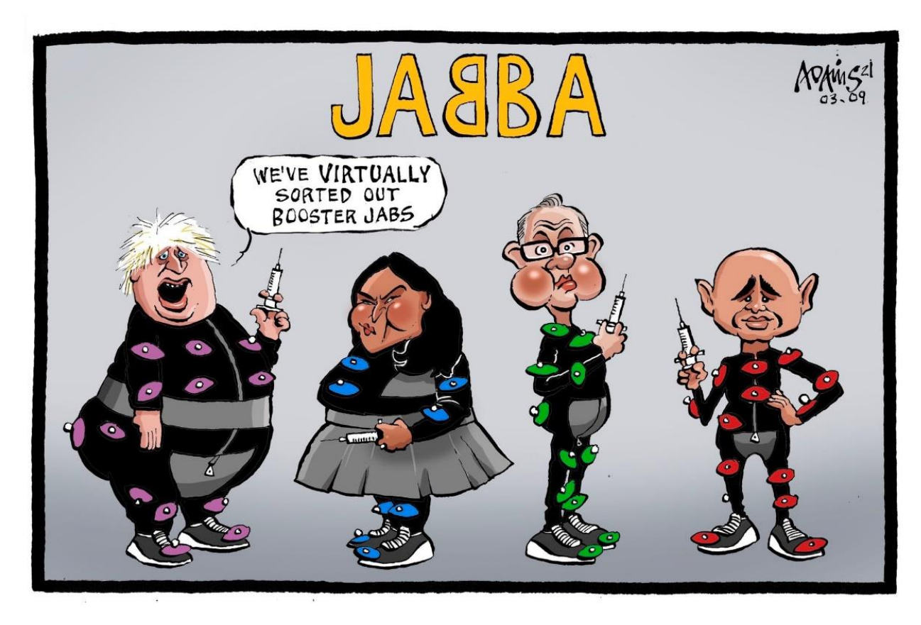
Booster jabs and ABBA