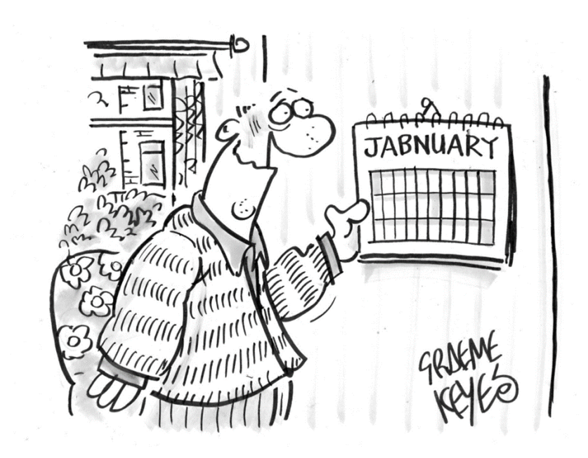
Graeme Keyes' outlook to the new year, 16 Dec 2020