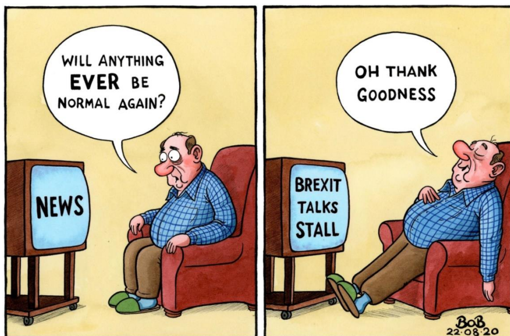
UK back to normal; Bob Moran, 22 Aug 2020