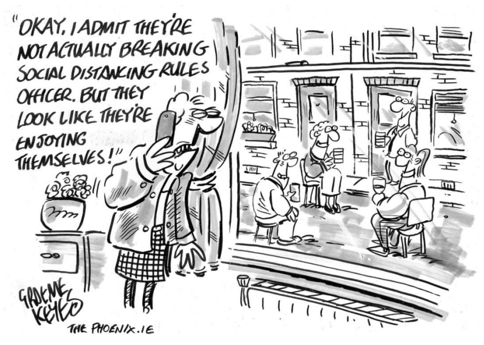
End of lockdown tensions? Graeme Keyes – 7 May 2020