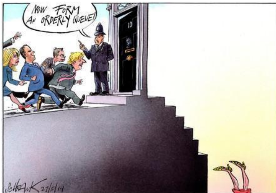
Source: Peter Schrank's perspective of the Queue for 10 Downing Street; 27 May 2019, PCGL